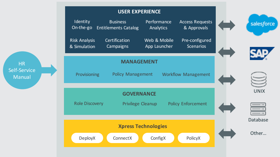
The CA Identity Suite User Experience

CA Identity Suite delivers a simple, business-oriented interface for key identity functions, helping to bridge the divide between current IAM technologies and business users.